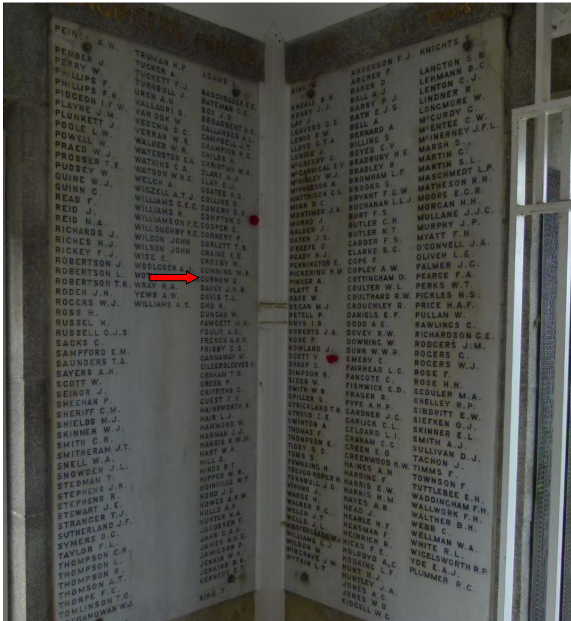
Engineers Corps Panel

Private D. Curnow is commemorated on the Roll of Honour, located in the Hall of Memory Commemorative Area at the Australian War Memorial, Canberra, Australia on Panel 174.